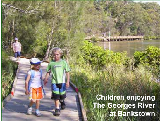
Children enjoying The Georges River at Bankstown

We invite you to put your name on the track!