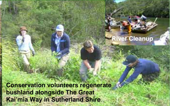
Conservation volunteers regenerate bushland alongside The Great Kai'mia Way in Sutherland Shire